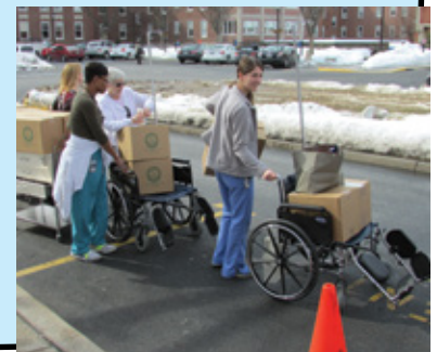
Anything with wheels helped deliver the food!