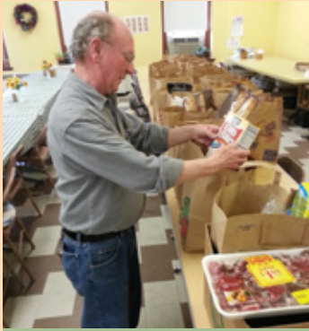
A volunteer prepares a pantry bag for distribution

On one day a month, the Center opens its doors to the entire Wernersville community and provides food assistance to any family or individual in need, regardless of age. Between 60 and 70 families a month (representing about 150 people) receive the food they need to help fill their plates and nourish their bodies. Of those receiving food, about 45 a month are seniors and another 40 are children. Providing the pantry (Berks Encore also hosts a pantry at their Mifflin Center in Shillington) is part of Berks Encore's overall mission of being a good neighbor. In May, the Wernersville Center's food pantry will celebrate its 15th anniversary of serving the hungry of their community.