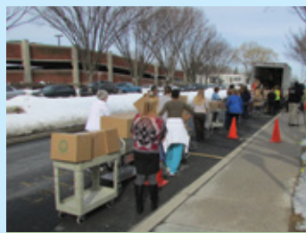
Reading Health System staff members line up to load their food collections into a GBFB truck

Thank you to all of the Reading Health System staff members for the amazing effort. We are excited to partner with them again in next year's Pound Per Person Challenge!